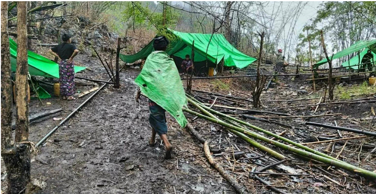
Conflict-displaced civilians are seen hiding in the mountains and forests.