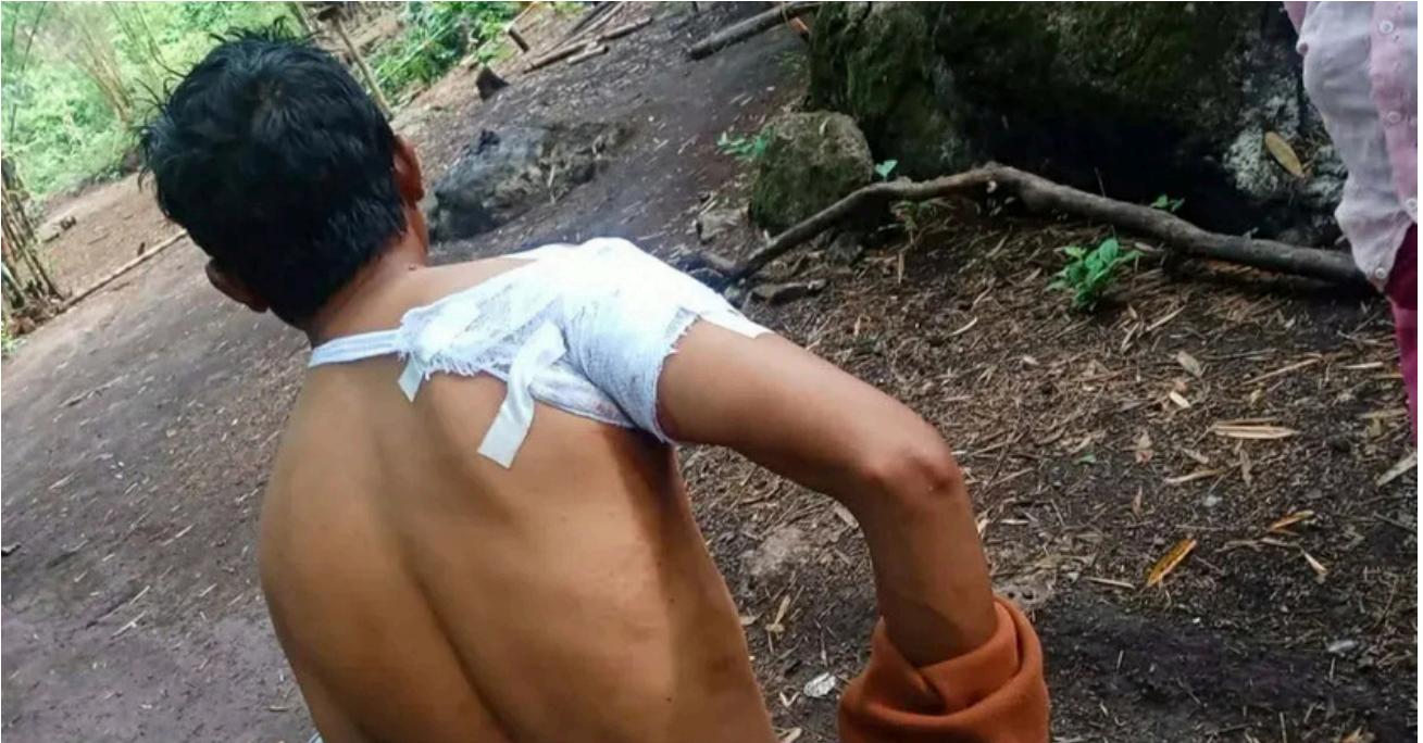
A survivor who managed to escape from Myanmar military junta troops is seen in this photo.