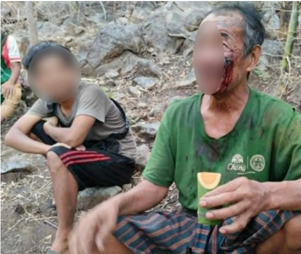
A displaced civilian is seen after allegedly being assaulted by Myanmar military junta forces.

The displaced people are currently having to relocate again to other areas. While they have received assistance with temporary shelters, they are still in need of food supplies.