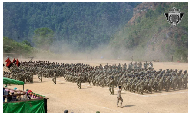
Photo – A view of the military parade ceremony announced by the No. (1) Alpha Military Region in Moebye.

The newly formed Alpha Military Region operates under the political, military, and administrative guidance of the Karenni Interim Executive Council (IEC), its Ministry of Defense (DOD), the Karenni Joint Chiefs Committee, and the Karenni Nationalities Defense Force (KNDF).