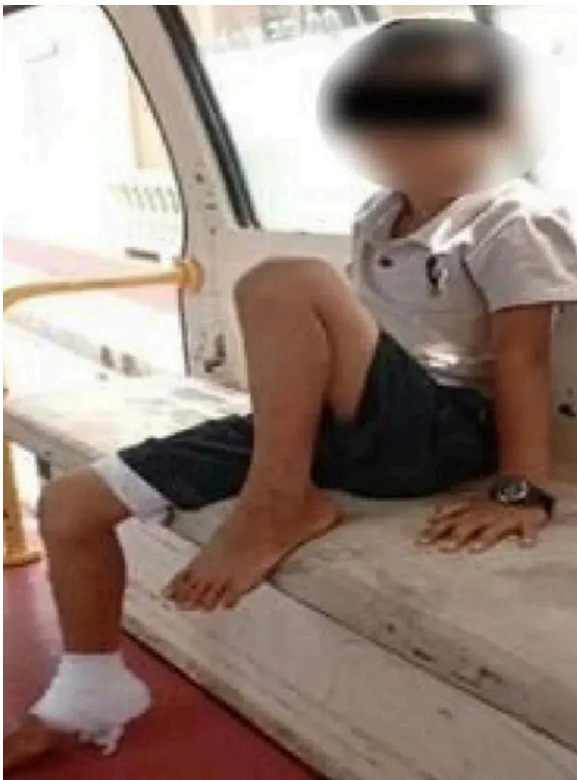
Photo – Two civilians who stepped on landmines on April 13, as released by the military regime

On April 23 and 25, the military launched drone and artillery attacks in Nanmekhon Township, leading to the deaths of 4 civilians and injuries to 2 others.