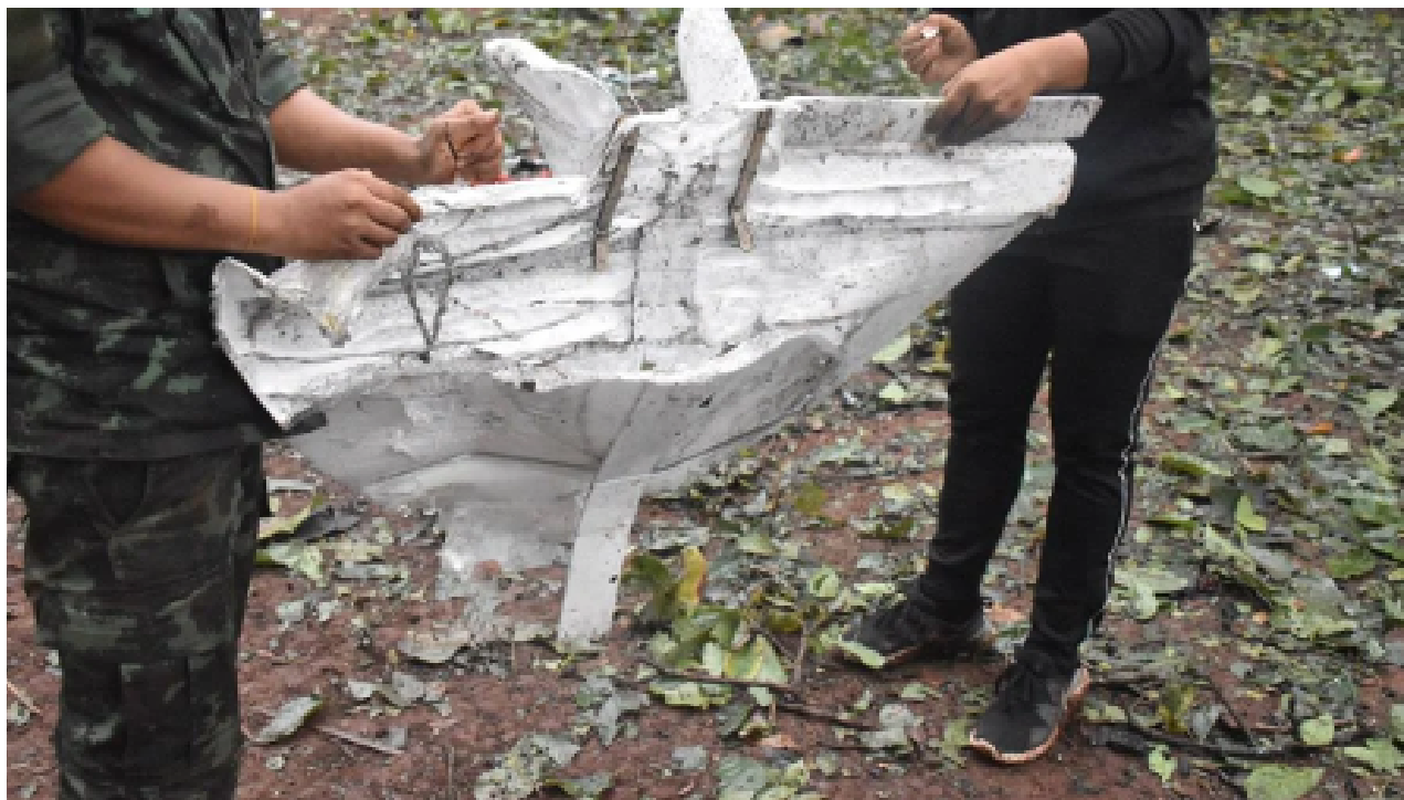
Photo: Junta forces carrying out a drone attack on a civilian area in the western part of Demoso Township during 2025. (File photo)