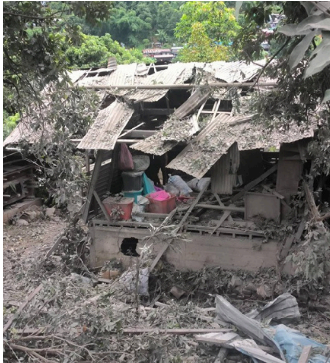
Photo: A view of destruction after a military airstrike by junta forces on a location in the Mawchi area in August 2025. (File photo)

The injured woman, aged 43, sustained wounds to her abdomen, thigh, and calf. The attack occurred despite no fighting in the area, with four bombs dropped on civilian areas.