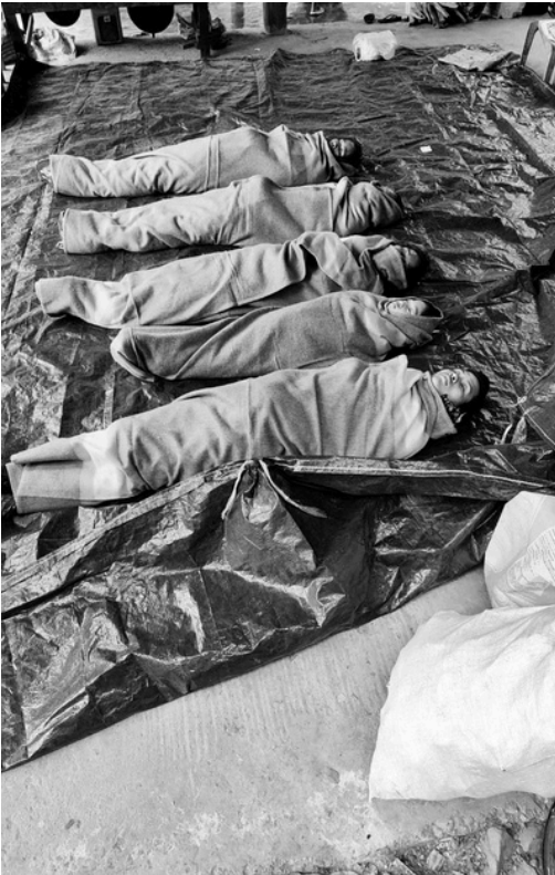
People killed in an airstrike on Mese Township, Karenni State, on March 5.